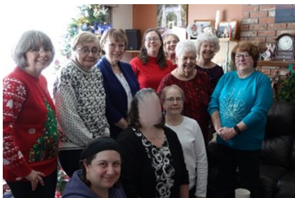
Members and guests

This year our family was from the Church membership. The gratitude from the family was expressed with tears and hugs. This shows us that we need to be aware of those in our congregation who are struggling and whom we can bless. We are so grateful that we were able to help this family with Christmas gifts and food.