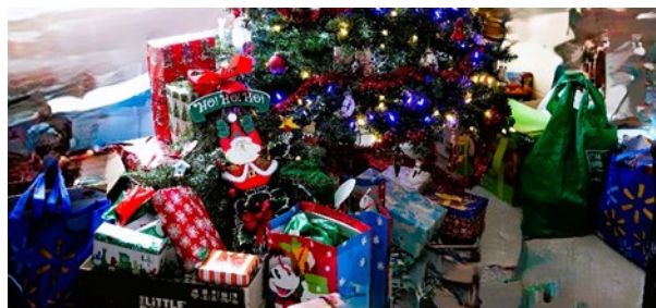
Food and Christmas Gifts for our adopted family