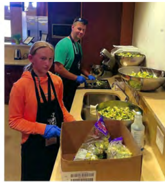
Chefs at Ronald McDonald House