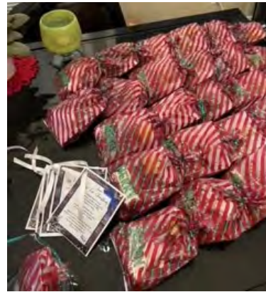
Packaged Christmas Bags