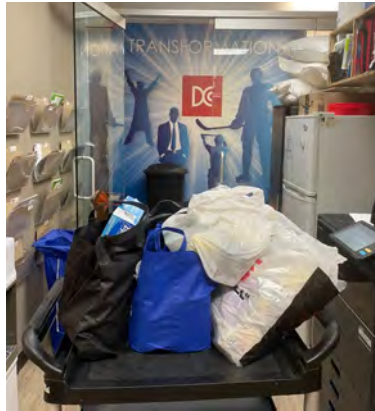
Calgary Dream Centre Donations