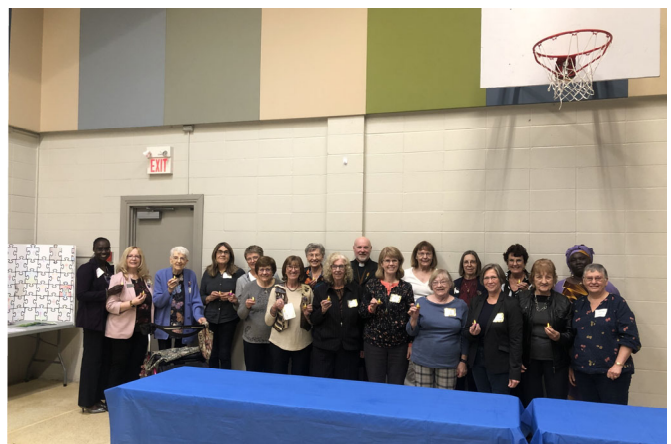
Concordia Zone Renewal attendees